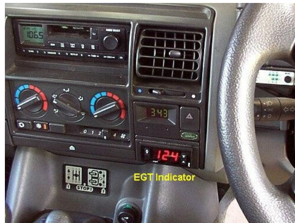
ThermoGuard Digital EGT Indicator with min/max recording function

Excessive EGT causes irreversible and expensive damage to engine components subjected to the extremely hot exhaust gases – most commonly turbo-charger housings and waste gate valves.